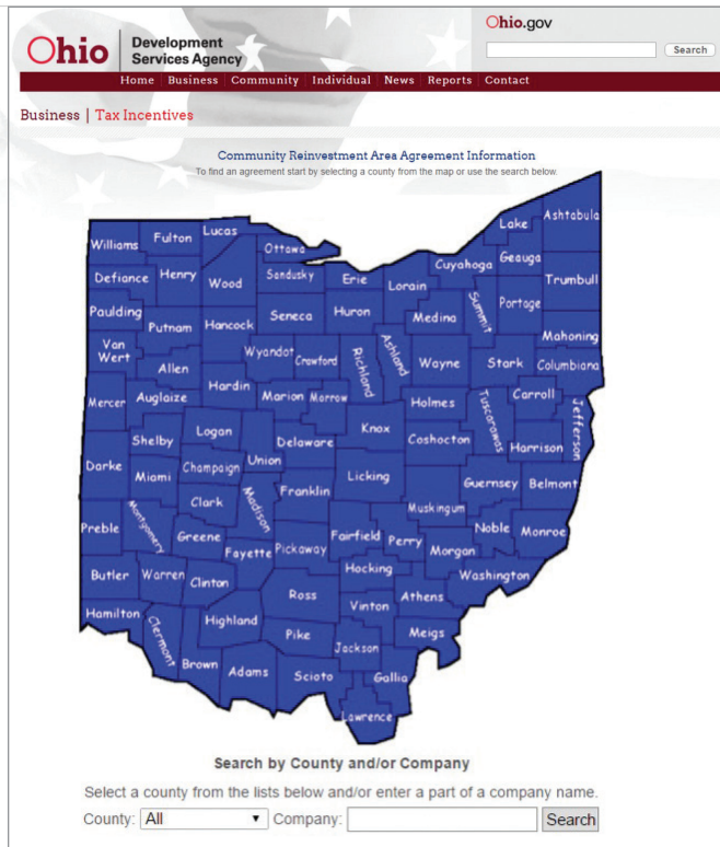
Ohio's compilation of local Community Reinvestment Areas.

used by local governments. Typical examples include Tax Increment Financing, enterprise zones and property tax abatements. State disclosure also enables the examination of a program across multiple localities. As cited, New York's disclosure of tax abatements and sale tax exemptions does it well; Texas' reporting of local property tax abatements (Chapter 312) does it poorly. The Texas Comptroller of Public Accounts publishes biennial reports on tax abatements that include information on subsidy duration, jobs created, and payroll, but the reports omit company names. 7 The office